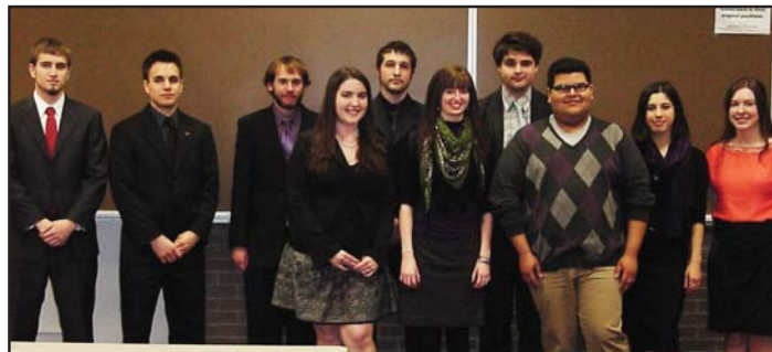
Participants in the 2011 Undergraduate Research Symposium

At the Symposium on March 25, ten students from Dickinson College, the University of Pittsburgh, and Washington & Jefferson College presented their research papers. The students were placed on three panels according to their paper topics, and each panel was judged by two faculty members and/or doctoral candidates. The student on each panel whose paper