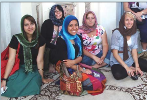
Students in Istanbul, Turkey