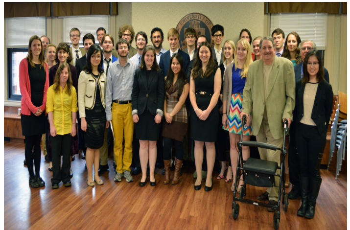
Student presenters and discussants at the 2014 Europe: East and West Undergraduate Research Symposium at Pitt.

Participants in the 13th annual Symposium on April 11, 2014 included a total of 27 students from 15 educational institutions, including American University, Brandeis University, Dickinson College, Macalester College, Mercyhurst University, Muhlenberg College, North Carolina State University, Northwestern University, Occidental College, Science Po Paris (Paris Institute of Political Science) in Reims, France, University of North Carolina – Chapel Hill, University of Pittsburgh, University of Washington, Washington & Jefferson College, and Williams College. This was one of the most geographically diverse participant groups in the history of the Symposium, with schools from eight U.S. states and two countries represented. Student presentations focused on a wide variety of topics, such as: "Orthodox, Soviet, or Anti-Western? Examining the Roots of Russia's Anti-Gay Legislation", "Islam in Chechnya: Political or Religious?" and "The EU Data Directive: Uniting Europe and Dividing Privacy."