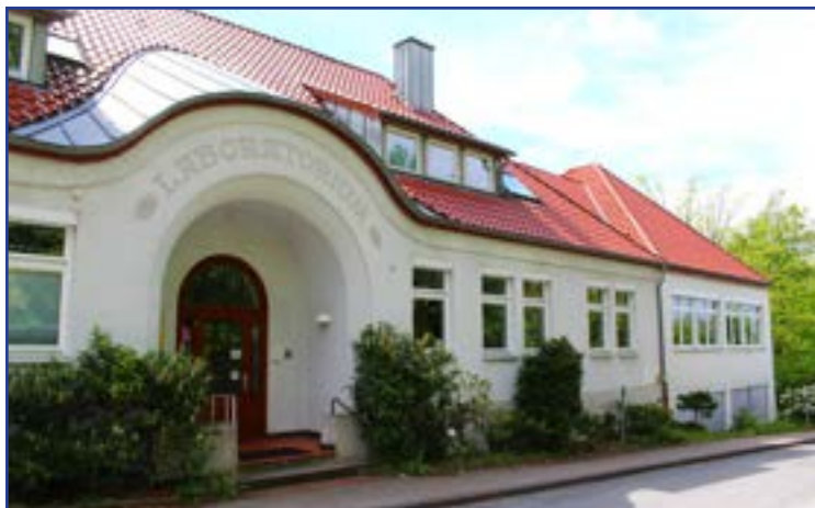
The laboratorium of Bethel, an epileptic colony in Bielefeld, Germany.

Last May, I traveled to Bielefeld, Germany to conduct archival research and take photographs for my project, “Investigating Historical Ties Between Epileptic Colonies in the United States and Germany.” The Bethel Institute in Bielefeld was the first epileptic colony in the world when it opened in 1867. By the early 1900s, the colony form had spread across the United States. Today, Bethel is a fully-functioning hospital serving the North Rhine-Westphalia region of Germany, and one of the leading institutions in Europe specializing in epilepsy. With the generous support of the Klinzing Grant for Pre-Dissertation Research, which covered my housing and transportation costs while in Germany, I was able to spend several weeks in Bielefeld this past summer researching exactly how and why the colony movement came to the U.S.