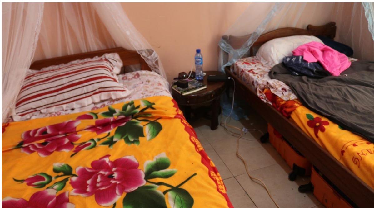
1 of 3 bedrooms in the main house where interns stay