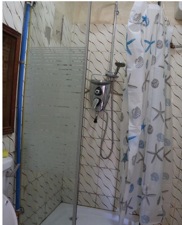
Living Room & Dining Room, Bathroom with full shower