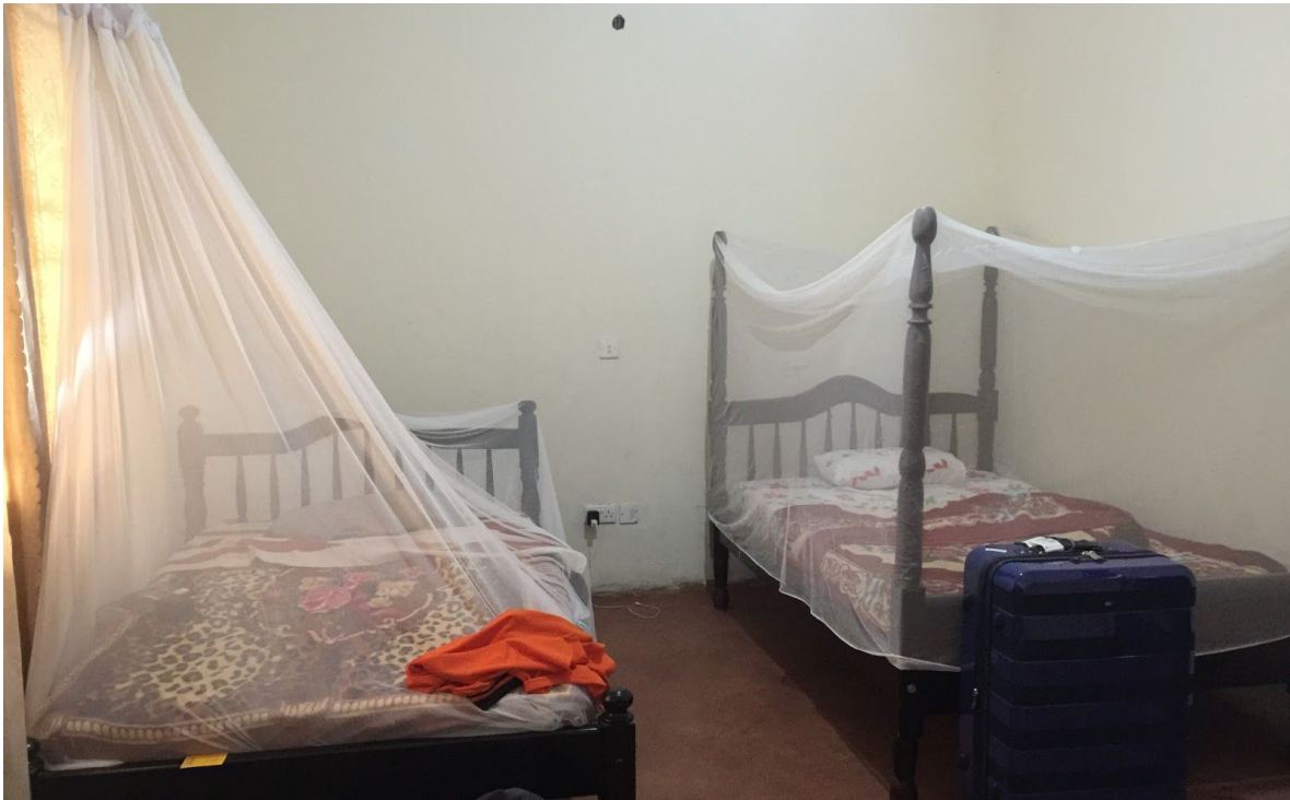
This space has two rooms, a bedroom and small living room with a bathroom