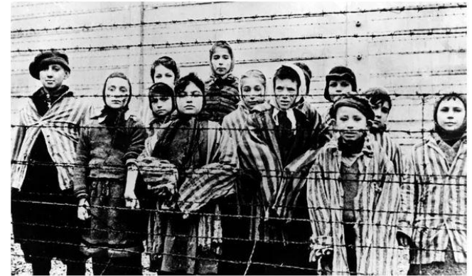
▲ Children wearing concentration camp uniforms shortly after the liberation of Auschwitz by the Soviet army on 27 January 1945.