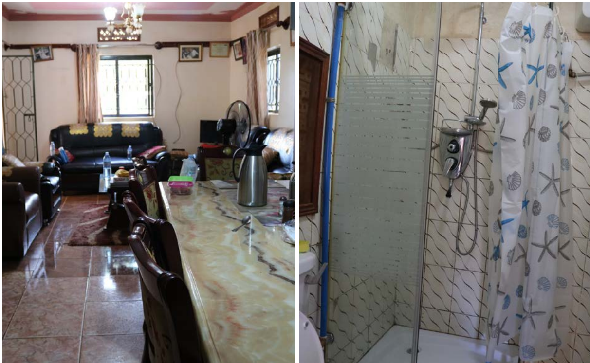
Living Room & Dining Room, Bathroom with full shower