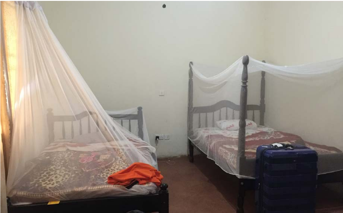
This space has two rooms, a bedroom and small living room with a bathroom