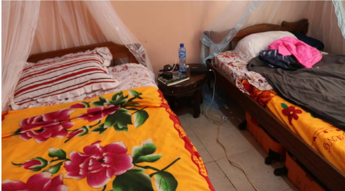
1 of 3 bedrooms in the main house where female interns stay