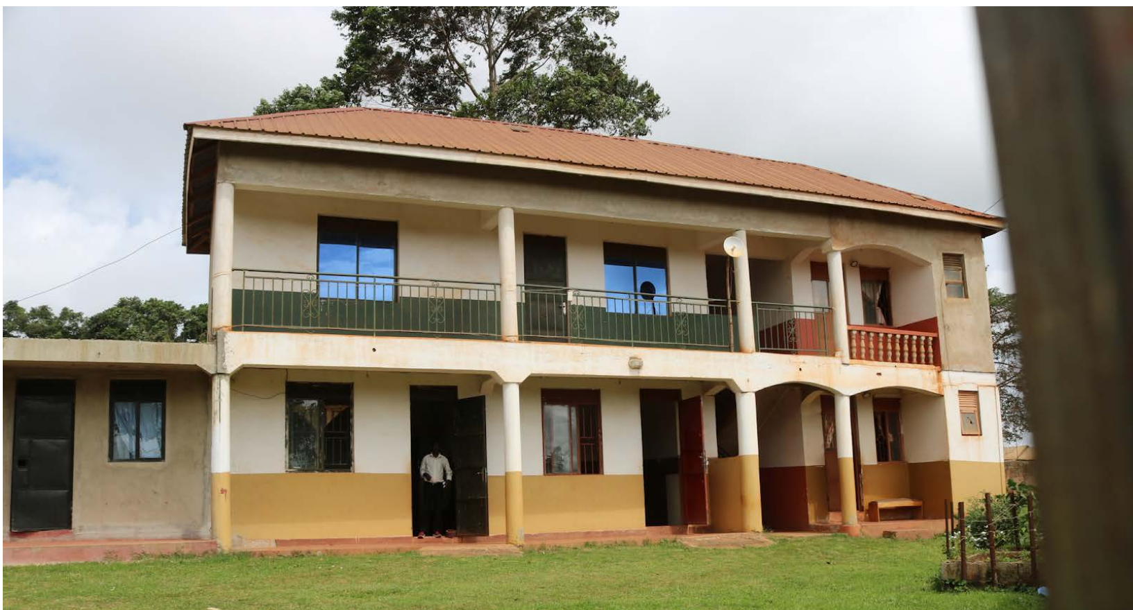
BKU Compound: male intern quarters, offices, nurses station