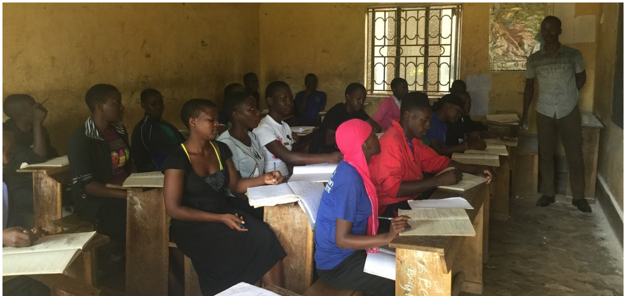
High School Students in Kinaawa Secondary School

Education students have the opportunity to teach a term (many subjects available) in East Africa during the summer months or intern with a school or organization. Students can choose from a variety of schools, subjects and various levels of experiences to get the much needed practice of working in a culturally diverse environment. These experiences will build their cultural competency and pedagogical skill-set and prepare them for their own classroom or career in education.