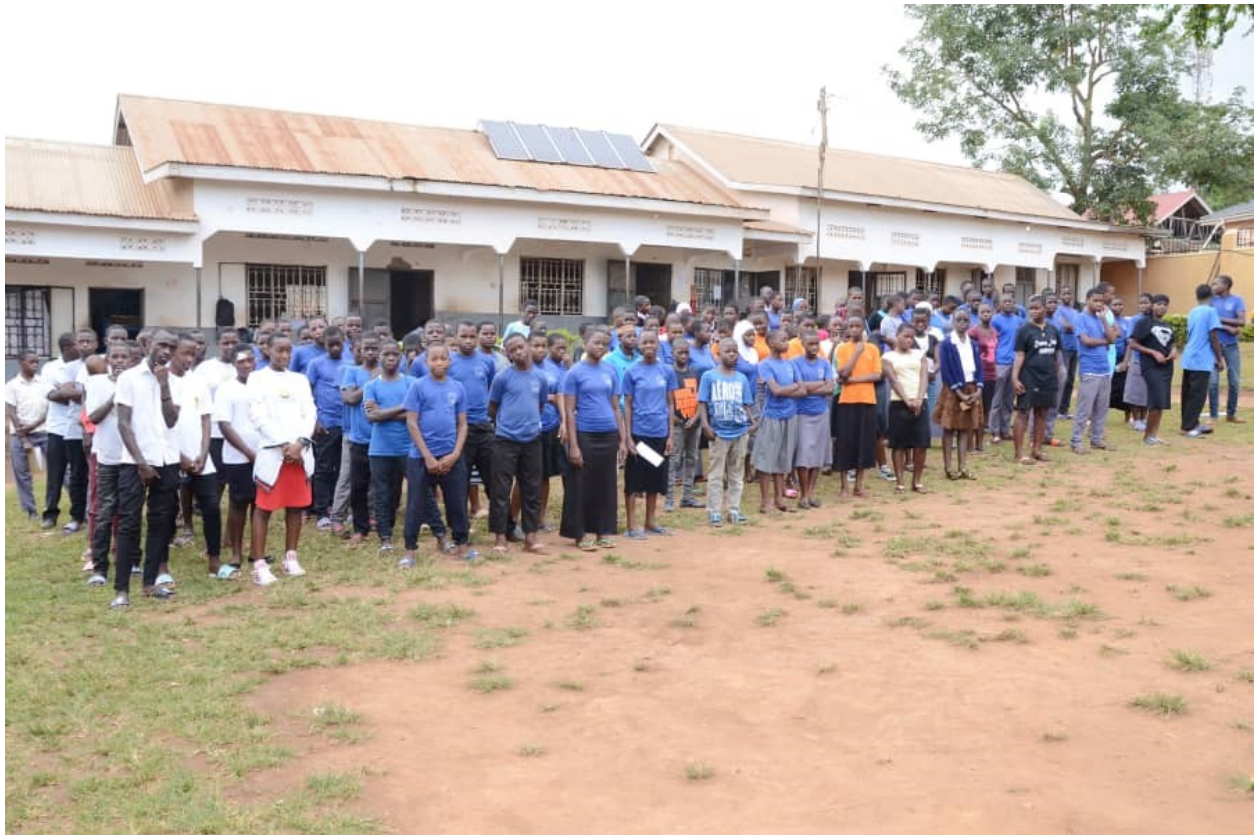
Students lined up before going into class

Kinaawa located in Kampala is 7 years old and has 253 students, with 191 of them boarding at the school. Even though they have average test scores they are strong academically and discipline wise in the community. They have strong infrastructure in modern science and computer laboratories. They have a motivated and qualified staff and accept learners and employees from all different religious backgrounds. They are also pro-parent and give rooms to low income students so that they can access education. They pride themselves on being non-discriminatory.