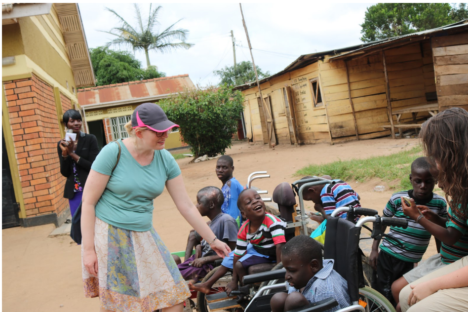
Pitt students Visiting Noah's Ark, a school for children with special needs.

Fall Semester or Summer: Students can take a directed study for academic credit.