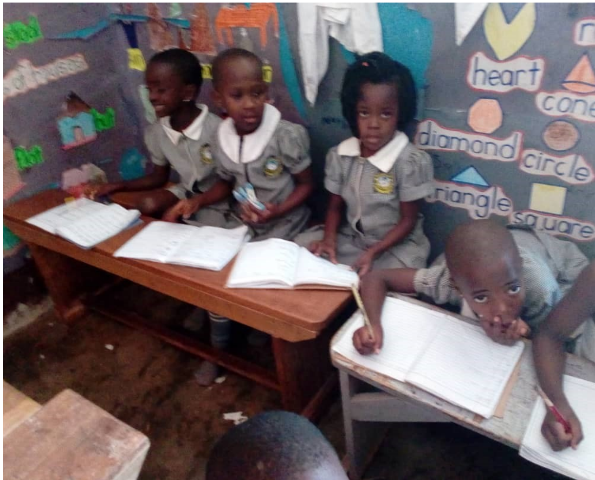
Students studying in this pre-school

This school is 3 years old and has 104 pupils. They play lots of games with the children and they are all promoted each year. Students work on Art, Social Studies, and English. Fees are less than neighboring schools. Orphans and the poor receive a free education. They desire interns who can help in teaching and developing their physical infrastructure.