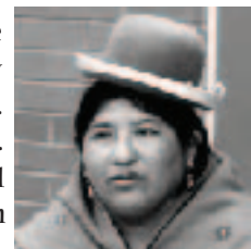
:: Paulina Arpasi

Honoring the Andean Woman: Women of the Andes—Voices Unheard—a presentation by Paulina Arpasi (Peruvian Congresswoman). Ms. Arpasi is the first Andean congresswoman in Peru. She was born and raised in an Andean rural community and from an early age was called upon to be a leader for the indigenous people.