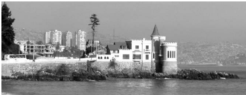
Viña Castle, Viña del Mar, Chile.