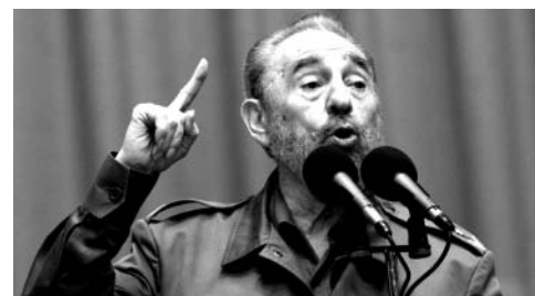
Cuban President Fidel Castro.

To mark the 10th docking, President Castro invited the faculty and staff to join him for cocktails in the convention center lounge after the encounter. SAS faculty and staff spent an hour talking with President Castro, discussing the current situation in Cuba and the United States, and requesting autographs.