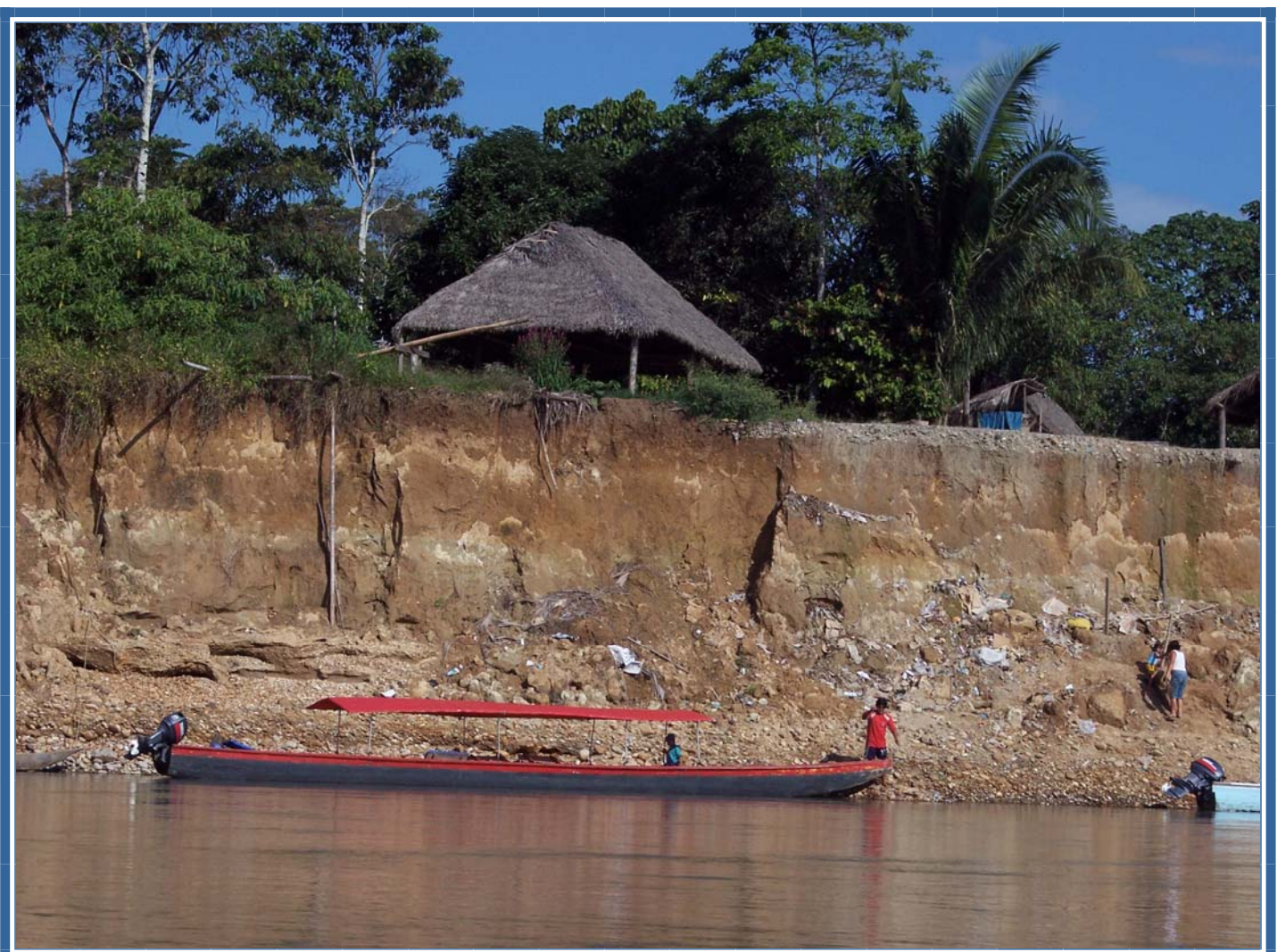
Indigenous Community on the Napo River, Napo Province, Ecuador.