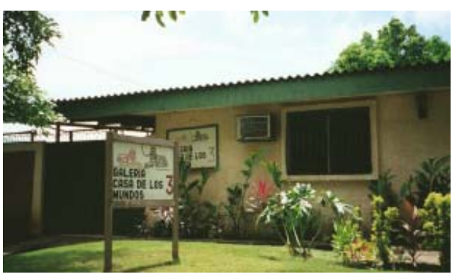
Casa Tres Mundos Cultural Center

came from this site, as well as others from around Nicaragua, are now housed in the San Francisco Museum in Granada. The museum also features paintings by Nicaraguan artists. Some of these artists are supported by the organization Casa