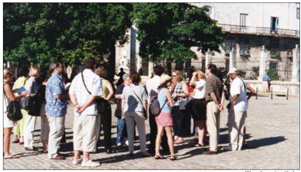
Teachers in Cuba