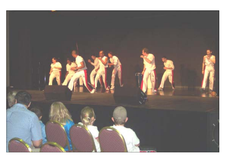
Nego Gato performing at the 25th Latin American & Caribbean Festival