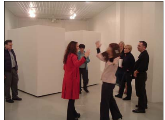
Teachers asking questions about art exhibit

As I read the comments from the teachers I started reflecting on what it was that I learned about Cuba. I thought I had a substantial knowledge about Cuba; but I was pleasantly surprise to realize that there was much more to learn. By experiencing the Cuban Art and realizing that each piece was made from old or recycle parts; yet each piece was designed to demonstrate the history, politics, economics, and creativity of Cubans.