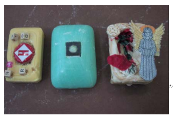
Teachers' projects with soap bars and different objects

http://www.ucis.pitt.edu/clas/outreach.html