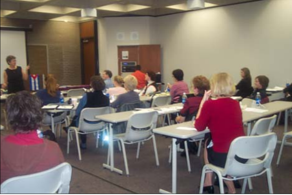
Teachers' workshop at Pitt

For more information or to register online see: www.aiu3/modules/news/.