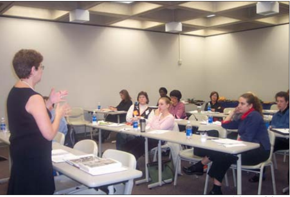
orkshop on Cube

Two units of the University Center for International Studies (UCIS)—the Center for Latin American Studies (CLAS) and the Pennsylvania Ethnic Heritage Studies Center (PEHSC)—have been chosen to host a teacher training workshop as part of the Allegheny County-wide professional development day for K-12 educators being held on Monday, October 10, 2005 . Throughout the day, approximately 8,000 teachers from 26 school districts will participate in workshops being held at over 45 sites throughout the county; including 26 high schools and partner organizations (ASSET Science, Bill of Rights Institute, Frick Art and Historical Center, Heinz History Center, The National Avery-Pittsburgh, Original Mattress Factory, The Pittsburgh Zoo, Soldiers and Sailors National Military Museum, University of Pittsburgh, The Watson Institute, Western