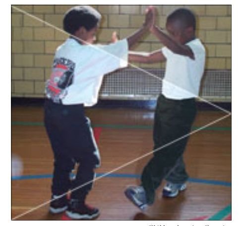
Children learning Capoeira