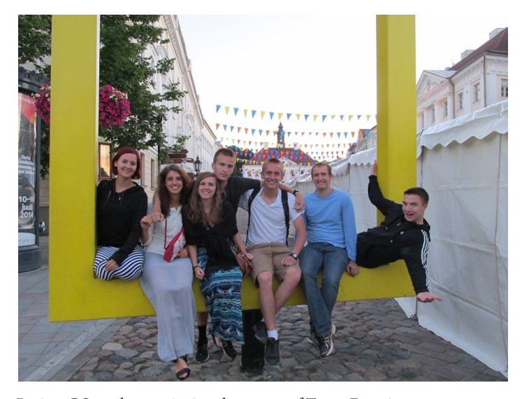
Project GO students enjoying the streets of Tartu, Estonia.

The city of Narva turned out to be an ideal location for studying Russian outside of Russia. In fact, from Narva one can really see Russia (Sarah Palin, eat your heart out!), and students walked past the border crossing almost every day on their way to classes. With a Russian-speaking population of over 93%, the language of Narva is Russian-it is spoken at the college, on the street, in shops and in cafes. Thus, in addition to their five hours of daily language classes, the students watched Russian television, listened to Russian radio, made Russian friends, and heard Russian opinions on current events. Indeed, their immersion began on the very first night in-country, when students participated in the all-night summer solstice festival of St. John's Eve and formed friendships with local Russians that lasted all summer.