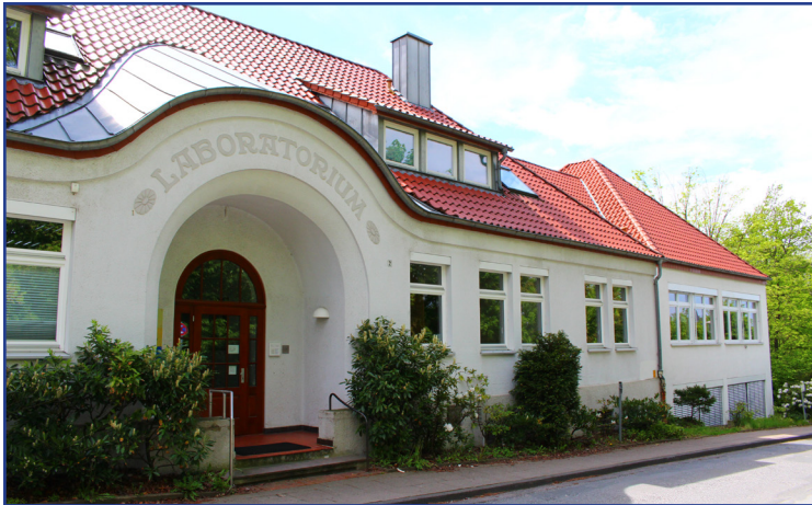
The labororium of Bethel, an epileptic colony in Bielefeld, Germany.

Last May, I traveled to Bielefeld, Germany to conduct archival research and take photographs for my project, “Investigating Historical Ties Between Epileptic Colonies in the United States and Germany.” The Bethel Institute in Bielefeld was the first epileptic colony in the world when it opened in 1867. By the early 1900s, the colony form had spread across the United States. Today, Bethel is a fully-functioning hospital serving the North Rhine-Westphalia region of Germany, and one of the leading institutions in Europe specializing in epilepsy. With the generous support of the Klinzing Grant for Pre-Dissertation Research, which covered my housing and transportation costs while in Germany, I was able to spend several weeks in Bielefeld this past summer researching exactly how and why the colony movement came to the U.S.