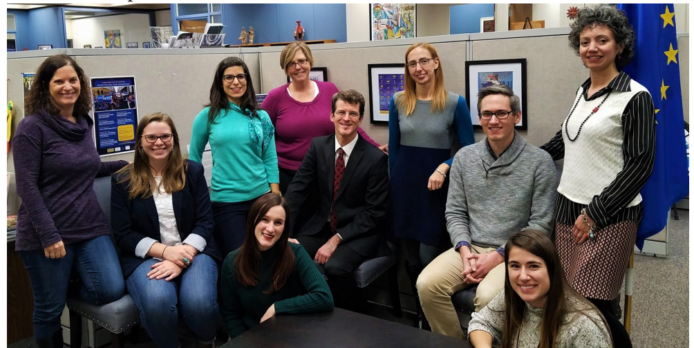
The ESC staff wishes you happy holidays and a happy New Year!