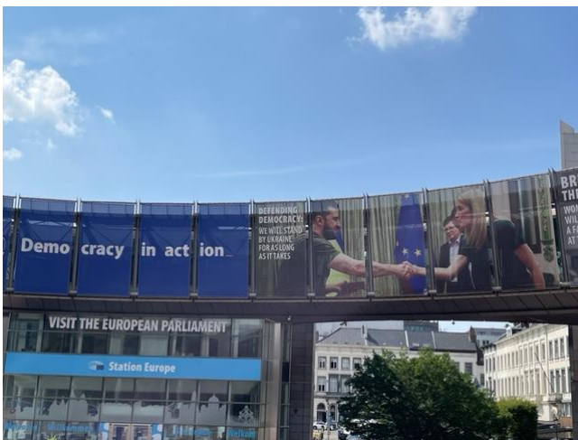
Description: Billboards outside the European Parliament