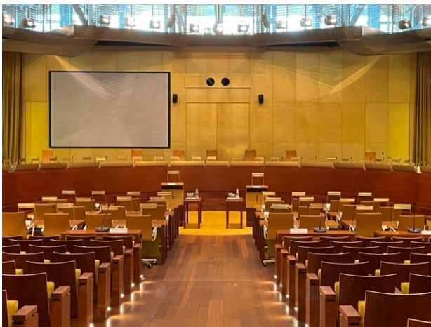
Description: Entrance to the ECJ Courtroom – One enters the room on a level of equality, i.e. equal eye-level with court justices. This reflects the values of the EU in the intentional architectural design.