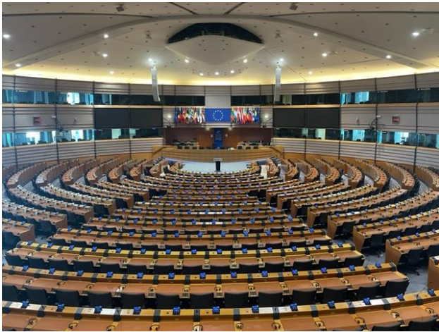
Description: The European Parliament