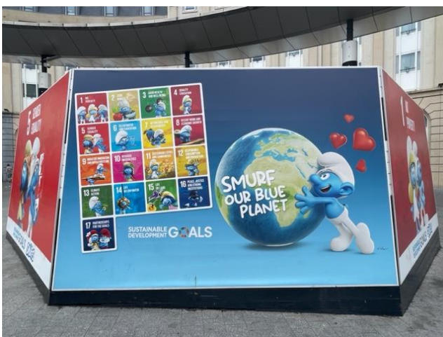
Description: Billboard promoting the UN Sustainable Development Goals in Brussels