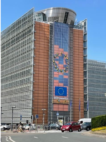
Description: The European Commission