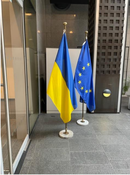
Description: EU and Ukrainian Flags at the EU External Action Service