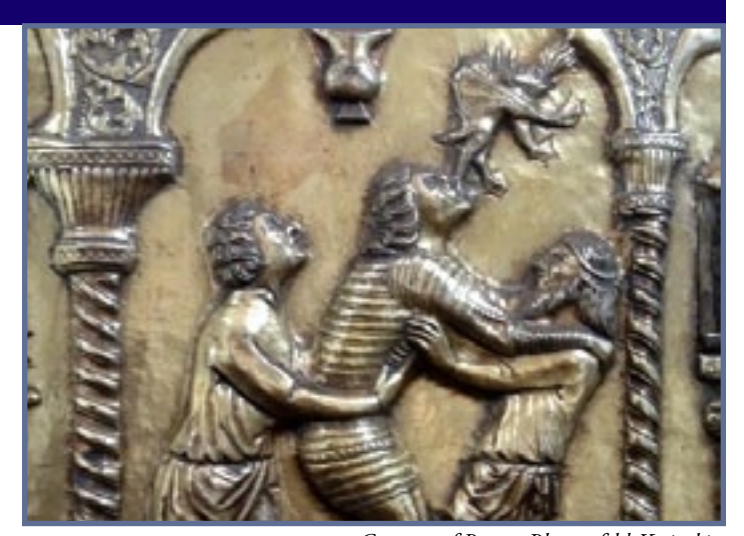
An image on a reliquary chest by Francesco d'Antonio da Sesto at the church of Saint Simeon in Zadar, Croatia.