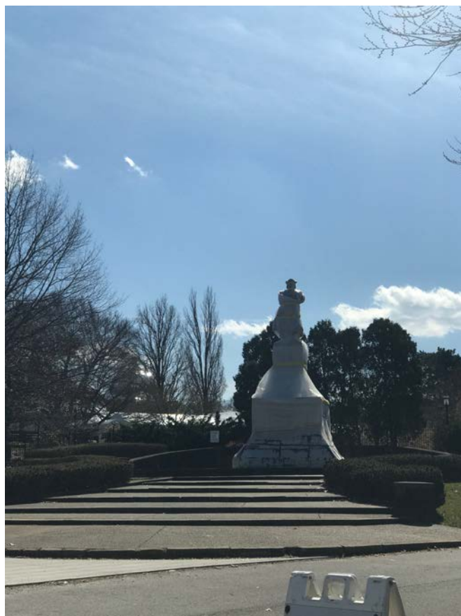
Columbus Statue

This semester, with the generous support of student research stipends provided by the European Studies Center (as well as from the Palamidessi-Bagedonow fund for Undergraduate Research in Italian Studies), a group of seven undergraduates has combed digital newspaper archives—in English and Italian—from 1909 until the late 1920s, with the aim of conducting some foundational research. Was Columbus commemoration a significant (and clearly stated) goal of the Italian immigrant community in Pittsburgh? What kinds of Columbus-related fundraising were being conducted in Pittsburgh at this time, and to what ends? What was the relationship between Columbus Day celebrations and the eventual coalescing of efforts to pay for, commission, and dedicate the Columbus memorial at the entrance to Schenley Park? Who were the figures most closely associated with these initiatives, and could they be called “ prominenti ”?