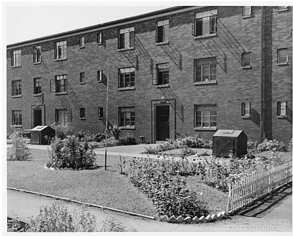
Bedford Dwellings (ca. 1951-1959), Pittsburgh, PA

leaves urban centers vacant. The UN Special Rapporteur on the Human Right to Adequate Housing has repeatedly condemned the “‘egregious’ business practices of giant private equity and investment firms which are scooping up low income and affordable homes around the world, ... substantially raising rents, forcing tenants out of their own homes.” 14 Likewise, on the local level, researchers provide extensive documentation of the tendency for powerful actors and institutions to favor growth-oriented policies that maximize returns on investment, with no concern for the human and social impacts. 15 Pittsburgh’s decades-long trajectory of declining population has reduced the city’s overall tax base, and private interests promising to kick-start growth have thus been able to wield undue influence on policy priorities.