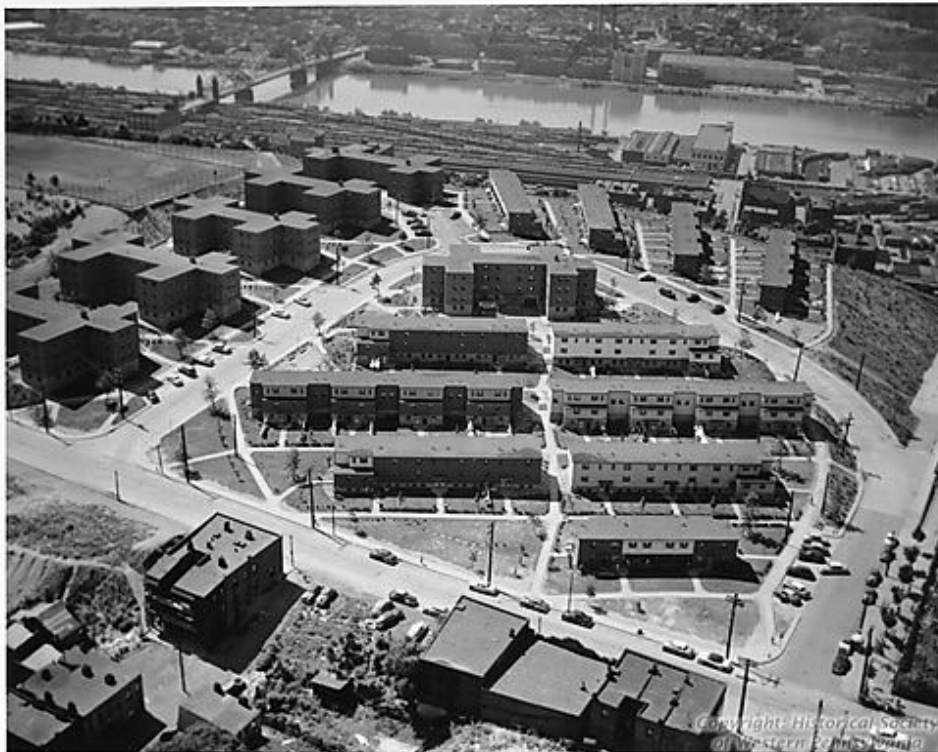
Bedford Dwellings Aerial View (1955) Pittsburgh, PA

After more than five decades of trial and research, what kind of track record do these PPPs have? Do they live up to the high hopes of those who put their faith in market-based solutions? Or, as critical analysts have suggested, do they enable the private sector to enrich itself at the expense of the public sector and the communities they claim to help? Our review of research on this question reveals that, in the long run, private for-profit firms largely fail to deliver the low-income housing they promise to provide. Instead, we find that privatization enables the transfer of public assets into private hands, facilitates private extraction of public resources, and undermines local democracy.