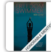
Freedom Swimmer by Wai Chim (Scholastic) Fiction | Set in China