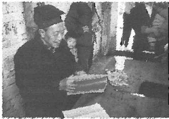
A Taoist priest telling fortunes, Qiyun Mountain, Anhui province.

useful in teaching the importance of Yin/Yang is the exercise form, Taijiquan. This "soft" martial art, practiced widely in China and increasingly popular in the United States, epitomizes the balance between Yin/Yang forces. It consists of constantly flowing movements; when weight shifts to the right leg, a move to the left leg soon follows; when one reaches up to the left, this is balanced with a movement up or down to the right. If the teacher has no student or adult capable of either demonstrating Taijiquan or teaching students some of the movements, several excellent videotapes are available. 8