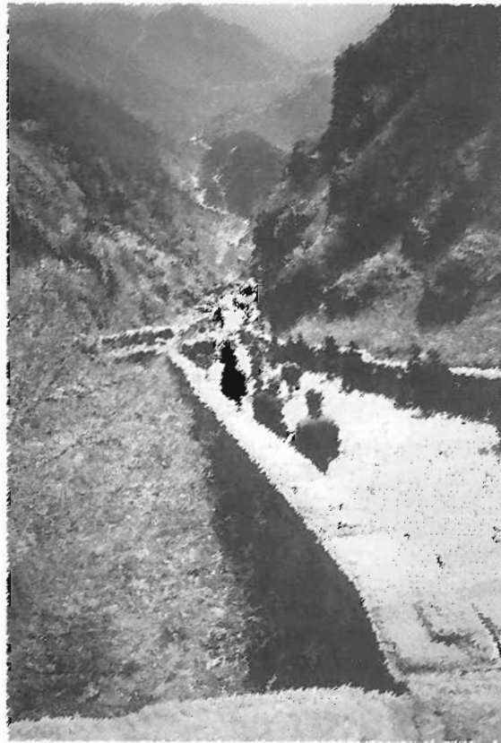
View from the South Gate of Mount Tai, Shandong province. This mountain has been a popular pilgrimage destination for thousands of years.