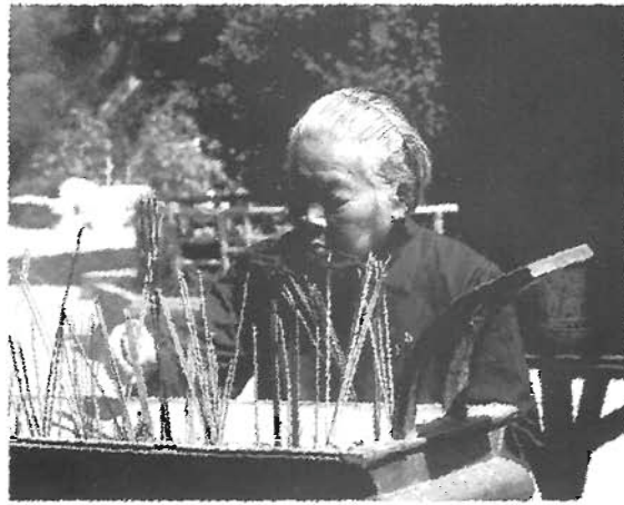
Woman burning incense at a temple in Shanghai.

cuisine permeate the American landscape, high school students are invariably familiar with not only the dishes, but more importantly, the style of presentation. Dishes are usually placed in the center of the table; meal participants reach into the dishes for their portions. There is a communal focus to the meals which contrasts with the American approach which typically presents each person with an individual portion. The research of Jordan Paper supports the validity of connecting Chinese