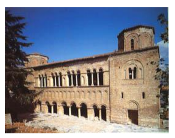
Church of St. Sophia in Ohrid, Macedonia

According to the CIA World Factbook, approximately two-thirds of Macedonians are Orthodox Christian and one-third are Muslim. Most Slavs in the country are Orthodox and most Turks, Albanians, and Roma are Muslim.