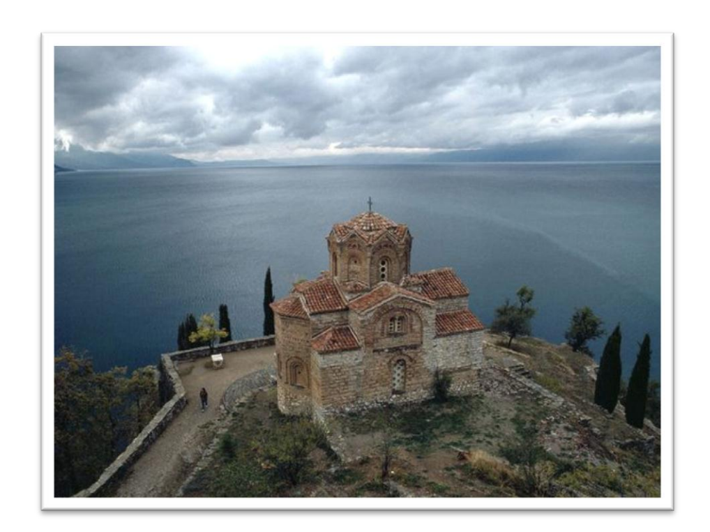
Center for Russian and East European Studies

University Center for International Studies University of Pittsburgh