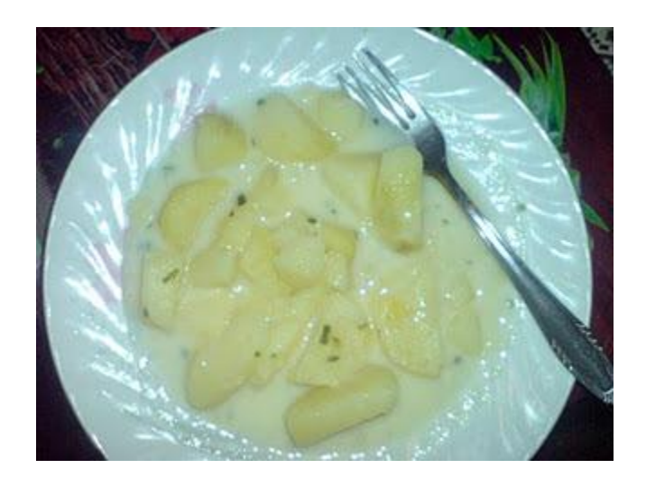
Recipe: 500 grams of peeled potatoes, cut into large cubes

For the Bechamel sauce: 1/4 cup butter 1/4 cup all-purpose flour 2 cups milk 2-3 cloves minced garlic Pinch of nutmeg (optional) Salt and pepper