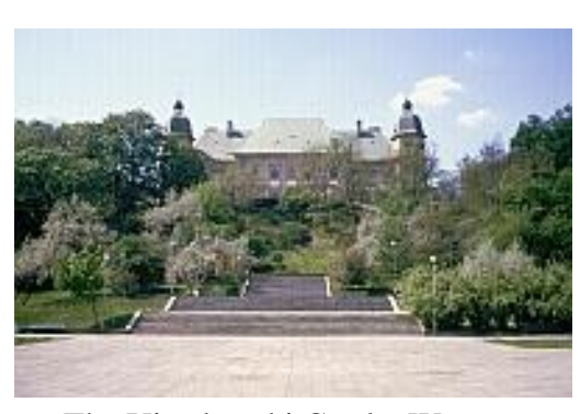
The Ujazdowski Castle, Warsaw