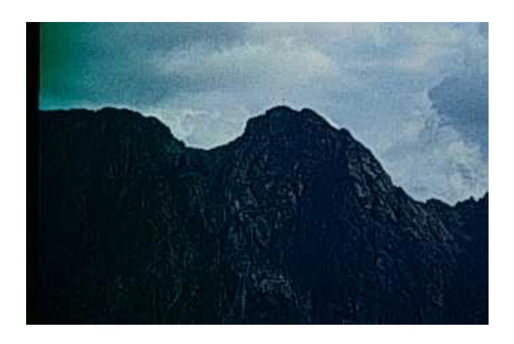
The Tatra Mountains

Coal is Poland's most important mineral resource. In 1980, total reserves were estimated at 130 billion tons. The largest coal deposits are located in Upper Silesia in the southwestern part of the country, where large-scale mining began in the 19th century. Silesian deposits, which are generally of high quality and easily accessible, accounted for about 75% of the country's hard coal resources and 97% of its extraction in the 1980s. The Lublin region of eastern Poland was exploited in the 1980s as part of an expansion program to supplement Silesian hard coal for industry and export. However, development of this relatively poor, geologically difficult, and very expensive field ended in 1990. A number of unprofitable Upper Silesian mines also were closed in the early 1990s.