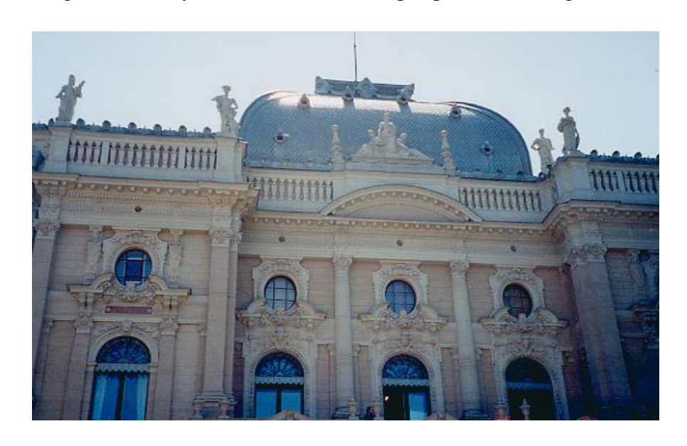
Building in Lodz

As a major player in such international financial institutions as the World Bank (see Glossary), the IMF, the Organization for Economic Cooperation and Development (OECD--see Glossary), the Paris Club (see Glossary), and the European Bank for Reconstruction and Development (EBRD--see Glossary), the United States led the effort to provide debt relief and other economic assistance to Poland. In early 1991, the United States pledged a further 20% reduction of Warsaw's debt to Washington. In a mid-1992 visit to Warsaw, President Bush praised Poland's political and economic reforms and proposed using the currency-stabilization fund to spur private-sector growth.