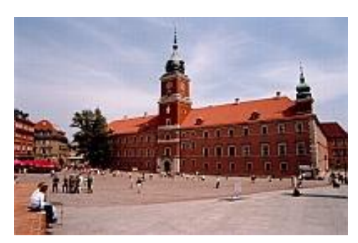
The Royal Castle, Warsaw