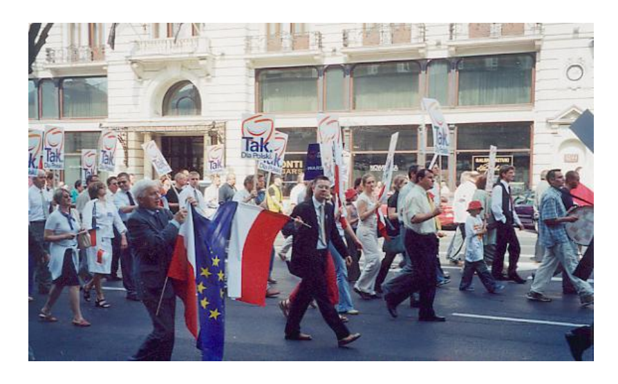
Demonstration in Warsaw in favor of EU membership (2003).

In December 1991, Poland reached agreement on associate membership in the European Community (EC), now referred to as the European Union (EU). Having taken this intermediate step, the Polish government set the goal of full EU membership by the year 2000. Among the trade benefits of Poland's entry into the EU would be the gradual removal of EU tariffs and quotas on Polish food exports; immediate removal of EU tariffs on most industrial goods imported from Poland and full membership for Poland in the EU free trade area for industrial goods; EU financial aid to restructure the Polish economy; and agreements on labor transfer, rights of settlement, cultural cooperation, and other issues. The agreement, which required ratification by the Polish government, all member nations of the EU, and the European Parliament, went into operation in the early 1990s. Poland was accepted into the EU in May 2004.