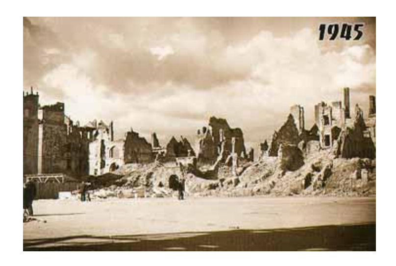
Town square in Old Town Warsaw after bomb damage