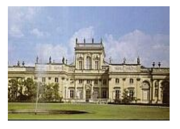
The Wilanow Palace, Warsaw

Photos throughout this guide were provided courtesy of: