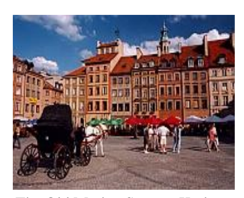
The Old Market Square, Krakow