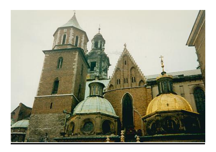
Wawel Castle, Krakow

Rich deposits of salt provide an important raw material for the chemical industry. Salt mining, which began in the Middle Ages, was concentrated in the Wieliczka-Bochnia area near Krakow until the middle of the 20th century. The major salt mining operations then moved to a large deposit running northwest from Lodz in central Poland. Salt is extracted in two ways: by removing it in solid form, and by dissolving it underground and then pumping brine to the surface. Annual output declined from 6.2 million tons in 1987 and 1988 to 4.7 million tons in 1989. Other mineral resources in Poland include bauxite, barite, gypsum, limestone, and silver (a byproduct of processing other metals).