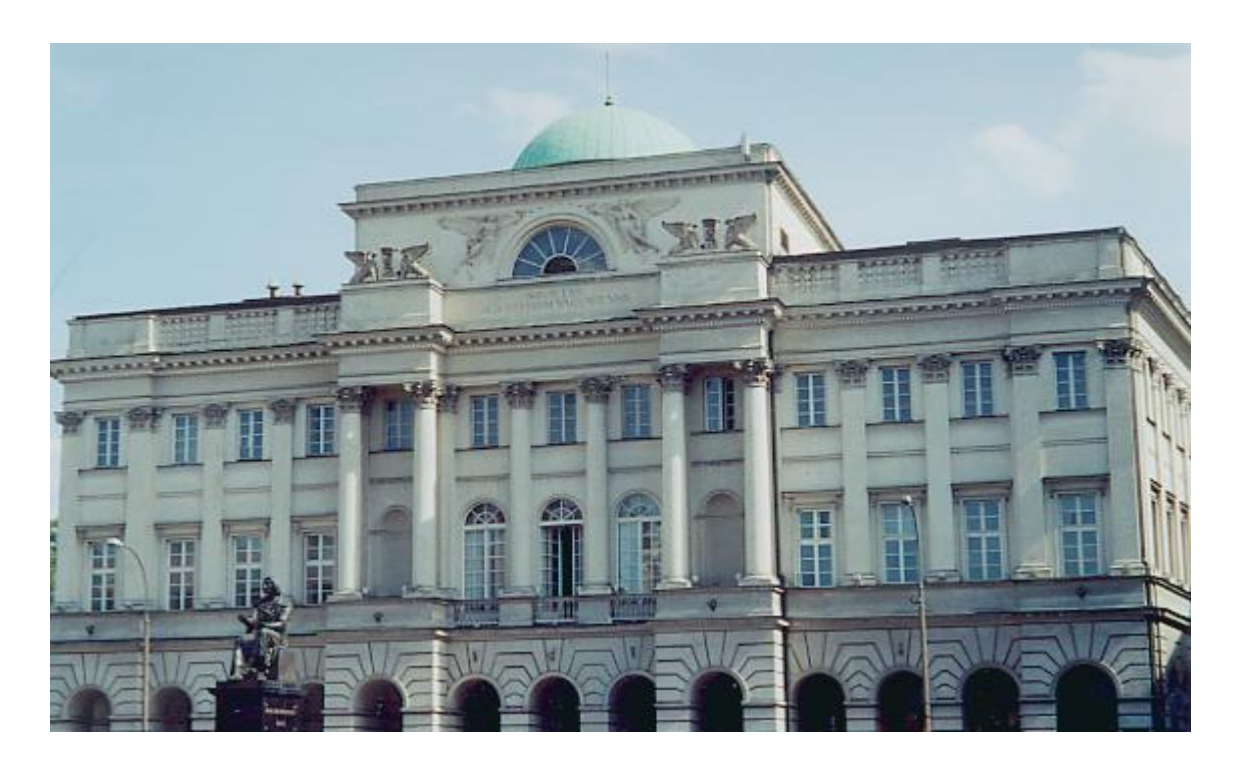
Polish Academy of Sciences building

Created by the Center for Russian and East European Studies University Center for International Studies