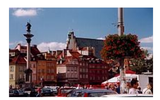
The Castle Square, Krakow