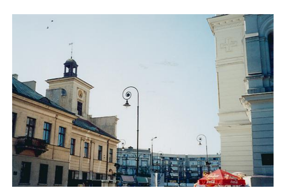
Piotrkowski Street in the main commercial district of Lodz, Poland's second largest city

Solidarity used its newly superior position to broker a coalition with various small parties that until then had been silent satellites of the PZPR. The coalition produced a noncommunist majority that formed a cabinet dominated by Solidarity. Totally demoralized and advised by Gorbachev to accept defeat, the PZPR held its final congress in January 1990. In August 1989, the Catholic intellectual Tadeusz Mazowiecki became prime minister of a government committed to dismantling the communist system and replacing it with a Western-style democracy and a free-market economy. By the end of 1989, the Soviet alliance had been swept away by a stunning succession of Central and East European revolutions, partly inspired by the Polish example. Suddenly the history of Poland, and of its entire region, had entered the post-communist era.