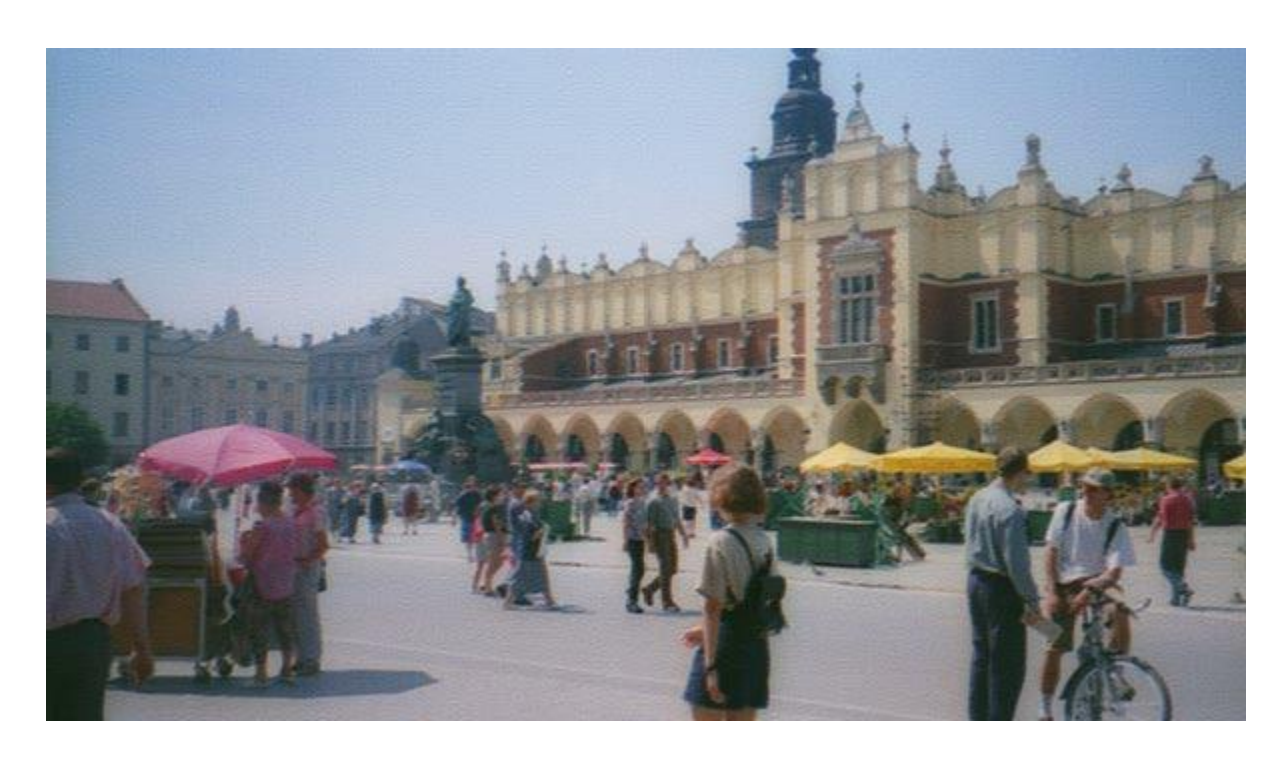
The Cloth Hall (Art Gallery) in Krakow