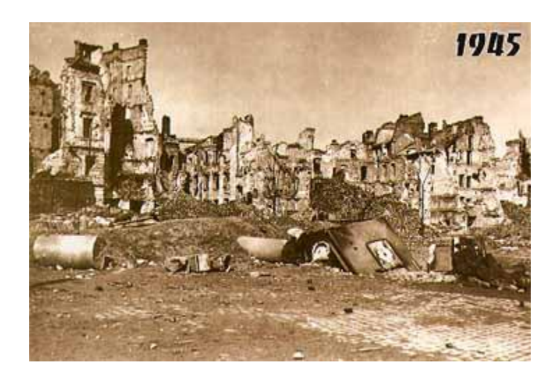
Area behind statue after Warsaw was destroyed by bombs