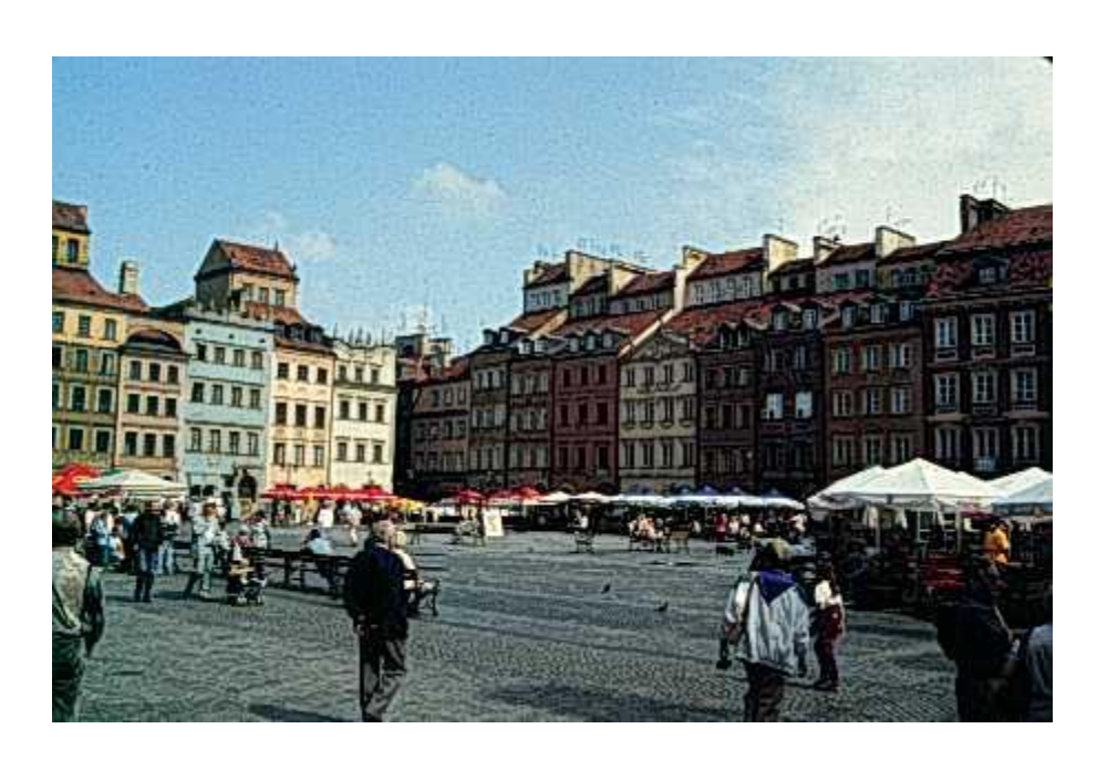
Old Town Square in Warsaw