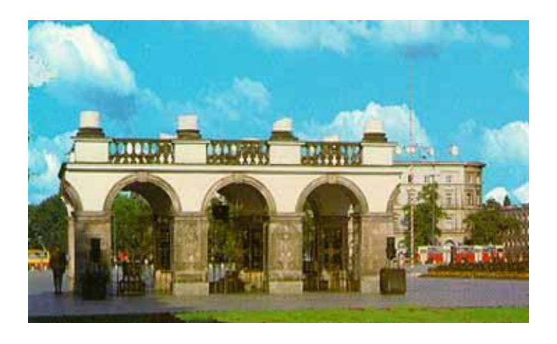
Tomb of Unknown Soldier after it was restored