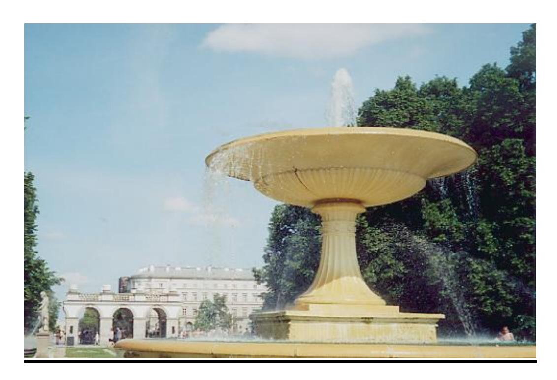
Park in central Warsaw, Tomb of Unknown Soldier in background

The political aspects of economic policy-making were problematic in the early reform years, as factionalism hindered government implementation of needed legislation. The impact of politics was especially noticeable in the privatization process, which was slowed dramatically by three changes in the privatization ministry between 1989 and 1992 and by attendant bickering over methodology and priorities. Nevertheless, by possessing relatively favorable human and natural resources and having taken some of the basic steps to repair the distortions of centralized management, the Polish economy showed signs of progress throughout the 1990s. Geographic location, despite being the cause of many tragic events in Poland's history, provides a potentially major advantage in the new context of a united Europe. Good commercial relations with neighbors on both sides – Germany, Ukraine, Belarus, and Russia – promise rapid recovery from the end of the Comecon era.