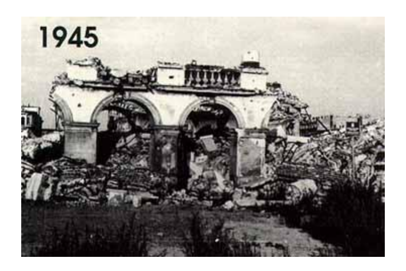
Tomb of Unknown Soldier in Warsaw after bomb damage