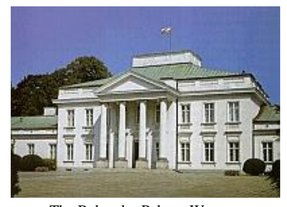
The Belweder Palace, Warsaw