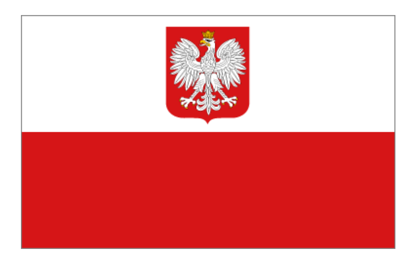
State Flag & Civil Ensign