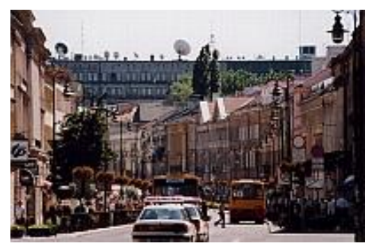
Nowy Swiat Street, Warsaw