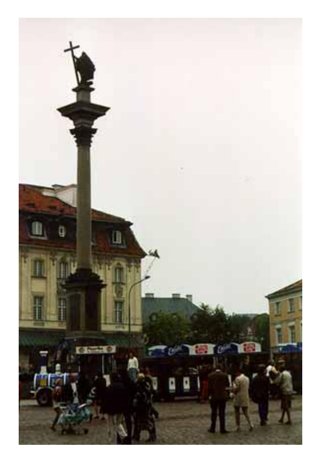
Current view of statue of King Zygmunt Waza at entrance to Old Town Warsaw