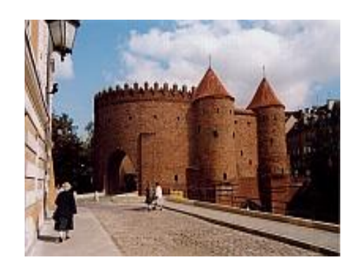
The Barbican, Krakow