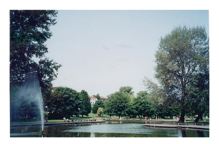
Park in central Warsaw

Until 1989 social policy making was centralized in the Planning Commission of the Council of Ministers. The post-communist reforms placed social policy responsibility in the Ministry of Labor and Social Policy and the Ministry of Health and Welfare, with the aim of liberating social policy from its communist-era linkage with economic policy considerations. The social welfare policy of the post-communist governments was planned in two phases. The first stage included short-term measures to offset the income losses of certain groups resulting from governmental anti-inflation policies. These measures varied from the setting up of soup kitchens and partial payment of heating bills to reorganization of the social assistance system. The second, long-term policy stage aims at rebuilding the institutions of the system to conform to the future market economy envisioned by planners. Communal and regional agencies are to assume previously centralized functions, and authority is to be shared with private social agencies and charities.