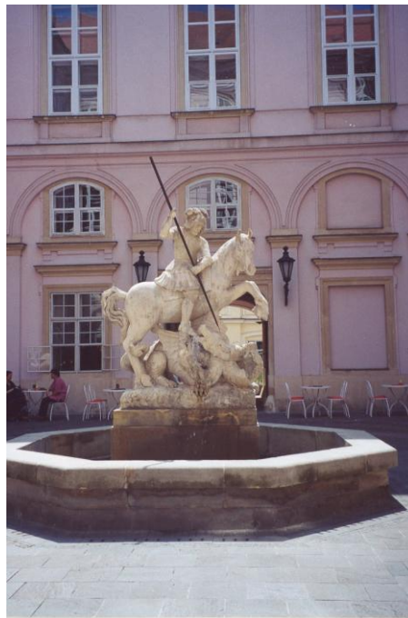
Courtyard in Bratislava

In May 2003, 92.4% of Slovak voters said YES to the question of whether or not Slovakia should join the European Union (see chart on the following page). Up to this time, all previous attempts to hold a referendum in Slovakia had failed. Never before had the required 50% of voters plus one vote been achieved – the minimum number of votes necessary for a referendum to be valid.