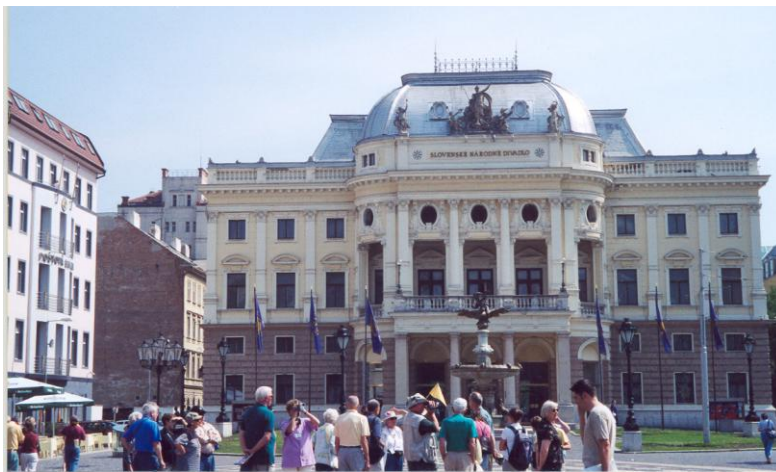
Slovak National Theater, Bratislava, Slovakia