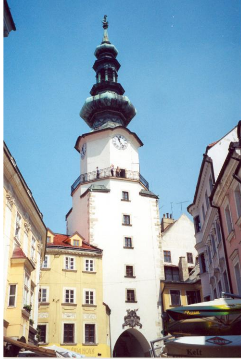
(Central Bratislava street scenes)