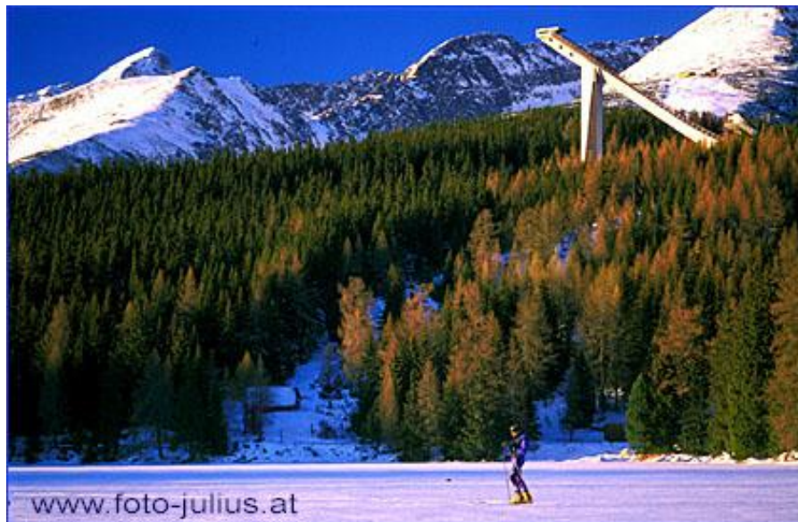
The High Tatra Mountains, Slovakia