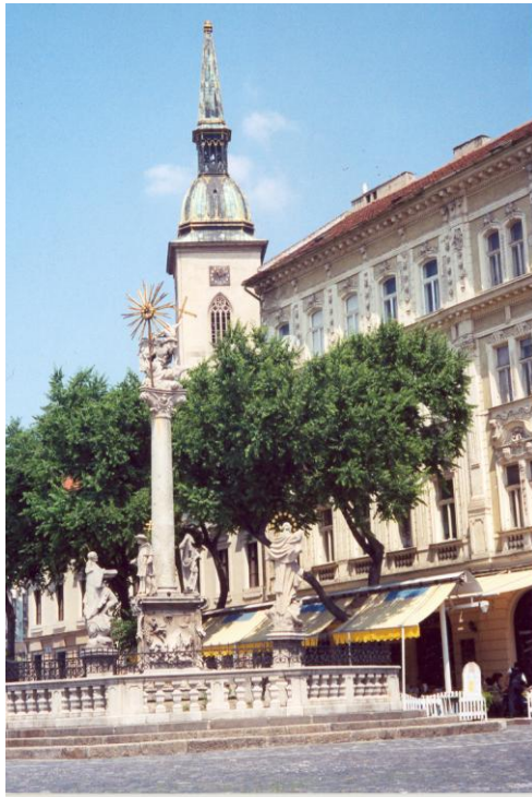
(Area around central town square)